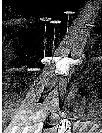
Illustration by Earl Keleny